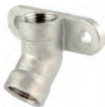
Bracket Item 6202